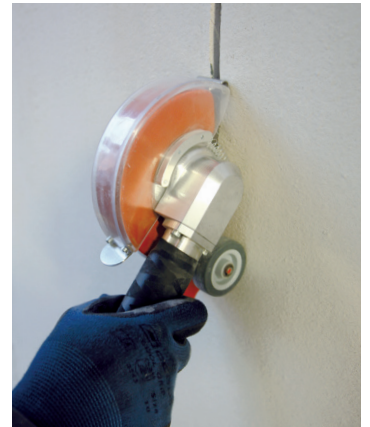
For cable slots in concrete, brick etc.