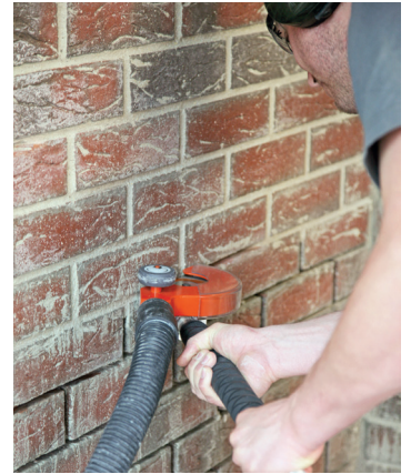
Milling out large surfaces quickly and cleanly