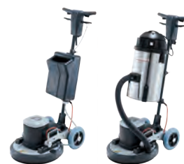
Tank or vacuum cleaner optionally available