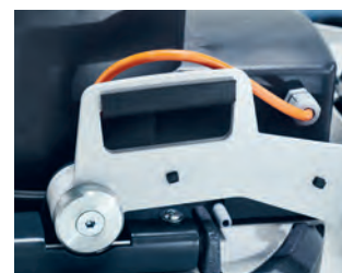
Ergonomic carrying handle for easy portability